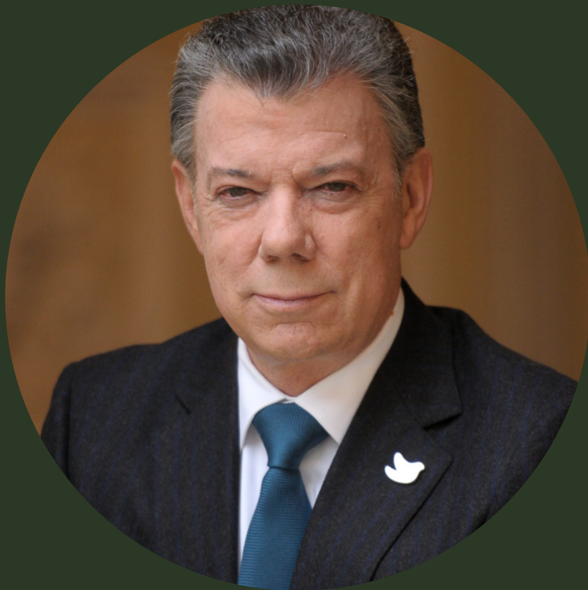
Juan Manuel Santos