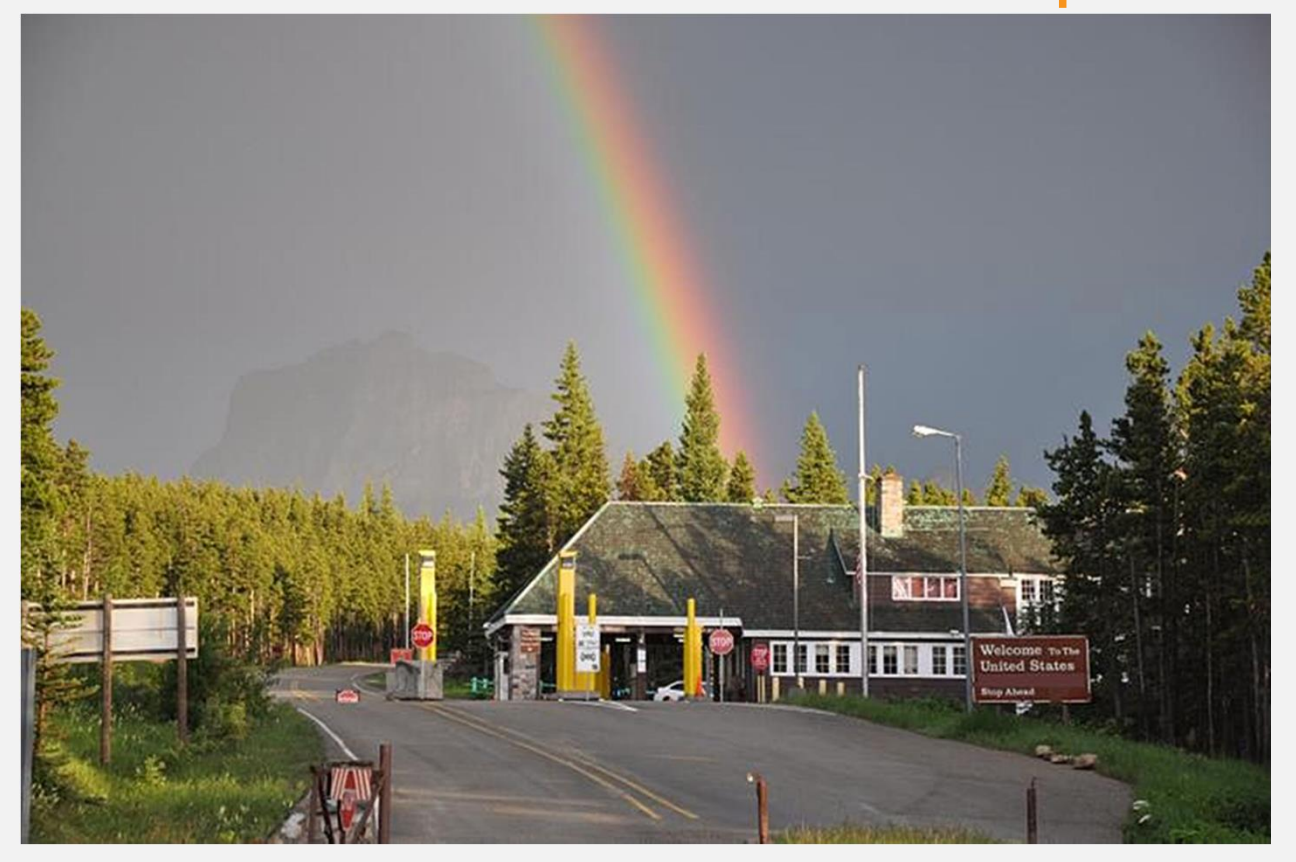
<sup>®</sup> US General Services Administration, April 2018