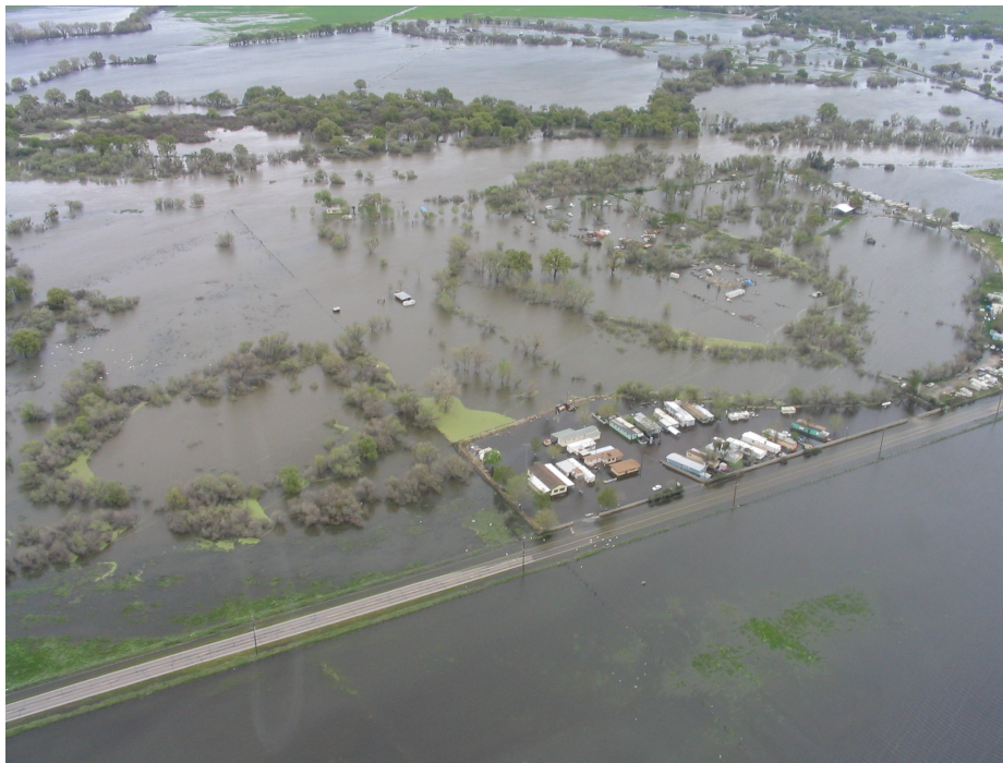
Flooding of farmlands and homes, San Joaquin Valley, CA.